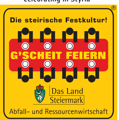
Waste and Resource Management